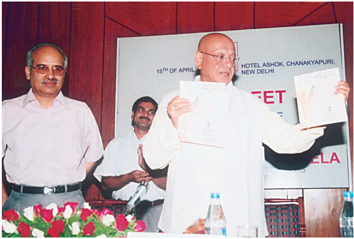
Shri Shankersinh Vaghela, Hon'ble Minister of Textiles, announcing the first ever National Jute Policy, 2005. Also seen in the picture Shri R. Poornalingam, Secretary (Textiles).