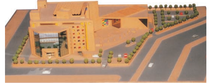
Proposed Building of Apparel International Mart (AIM)