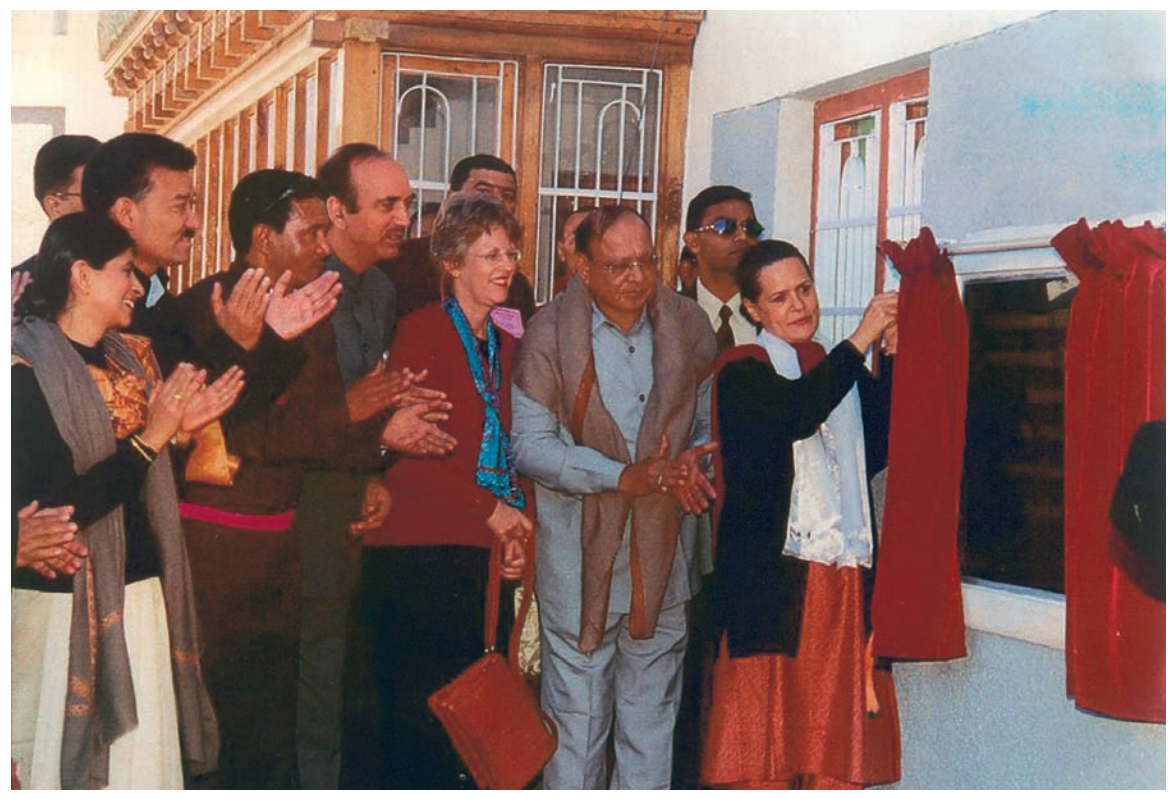
Smt. Sonia Gandhi, Chairperson, National Advisory Council (NAC) alongwith Shri Shankersinh Vaghela, Hon'ble Minister of Textiles & Shri Ghulam Nabi Azad, Hon'ble Minister of Parliamentary Affairs and Minister of Urban Develepmont inaugurating the Pashmina Dehairing Plant at Leh, Laddakh