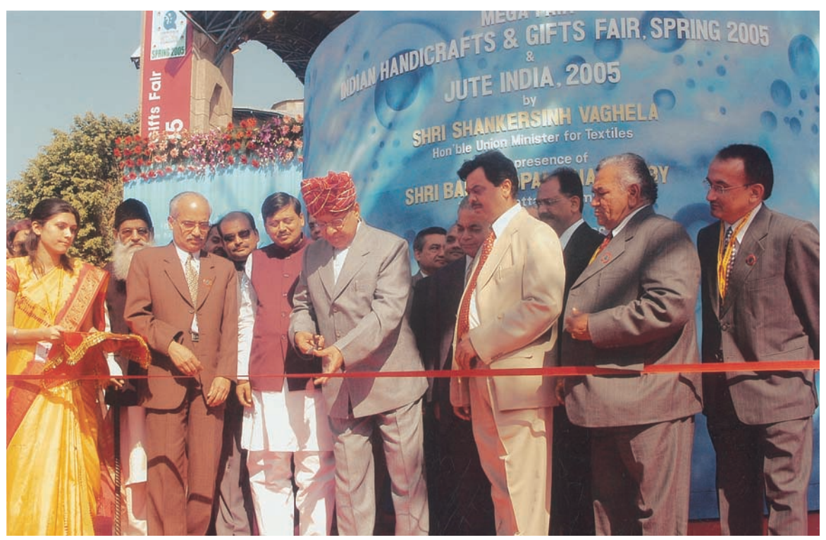
Shri Shankersinh Vaghela, Hon'ble Minister of Textiles, inaugurating Indian Handicrafts & Gifts fair, Spring 2005 & Jute India, 2005. Also seen in the picture are Shri R. Poornalingam, Secretary (Textiles) & Shri Navrattan Samdaria, Chairman, Export Promotion Council for Handicrafts

The previous Government tried to dilute the Mandatory Jute Packaging Order by reducing the use of Jute in food grain and sugar packaging to 60% and 50% respectively. This would have acted against the interests of 40 lakh jute farmers.