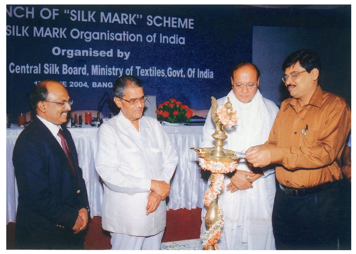
Shri Shankersinh Vaghela, Hon'ble Minister of Textiles, launching the "Silk Mark" Scheme in Bangalore