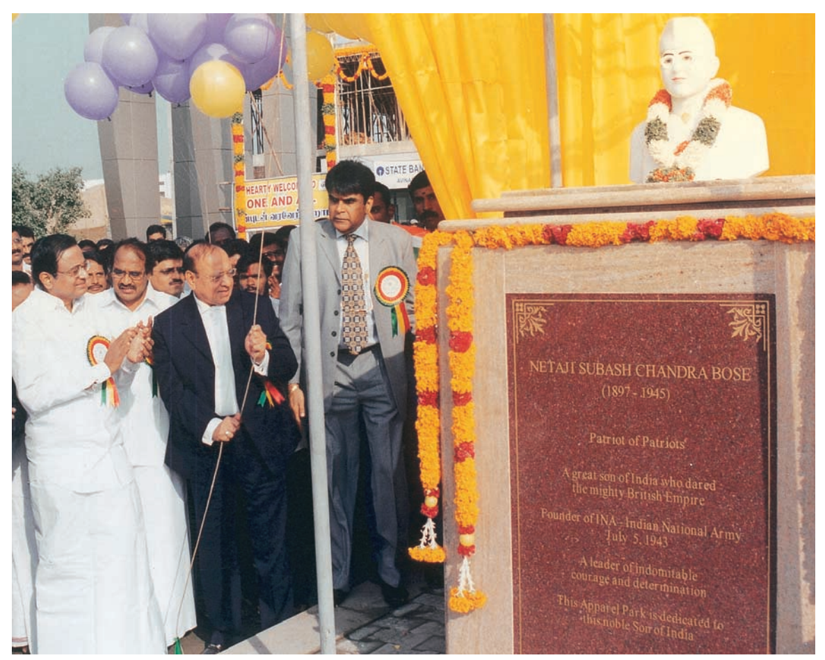
Shri Shankersinh Vaghela, Hon'ble Minister of Textiles alongwith Shri P. Chidambaram, Hon'ble Minister of Finance unveiling the statue of Netaji Subash Chandra Bose, while Inaugurating the Apparel Park at New Tirupur