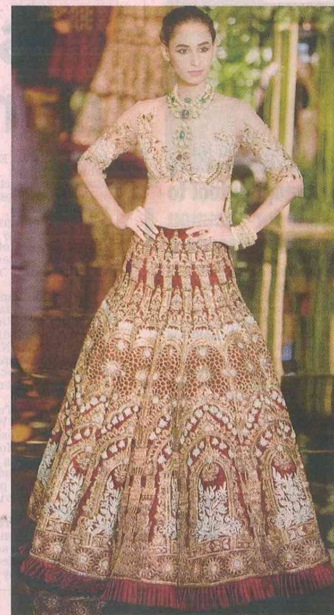
Actors Deepika Padukone, Fawad Khan and designer Manish Malhotra along with models (left, extreme right) walk the ramp at the India Couture Week 2016 in New Delhi on Wednesday.