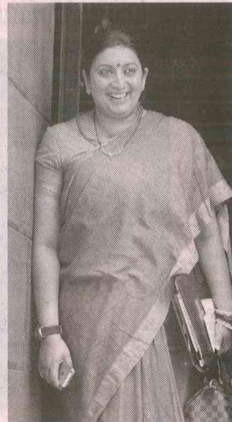
Samajwadi Party member Jaya Bachchan (clockwise from left), CPI(M) general secretary Sitaram Yechury with Union minister for law and IT Ravi Shankar Prasad, Union textile minister Smriti Irani, Union minister for urban development and I&B M. Venkaiah Naidu and BJP MP Paresh Rawal during the Monsoon Session at Parliament House in New Delhi on Thursday.